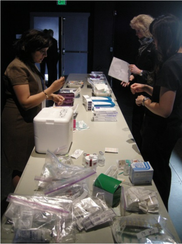
The injection setup